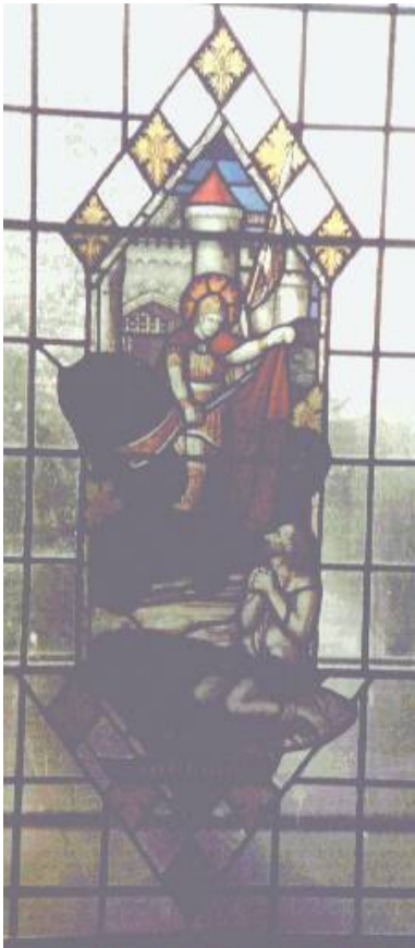
Stained glass showing St. Martin of Tours

It wasn't until Penda's son Peada was converted to Christianity in 657 AD by four Roman missionary priests and through his marriage into the Christian Northumbrian royal family that Mercia became Christian. In this time the outward form of religion was more a matter of a public procedure than private conviction, and the populations of whole kingdoms changed religion with their rulers. It wasn't until 669 that Lichfield Cathedral was built as the focus of Mercian Christianity, shortly followed by some monasteries.